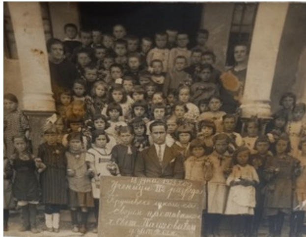
Figure 1. Elementary school in Kruševo, 1928.

Private schools were under state supervision, and compulsory subjects included the Serbian language, and in the higher grades, Serbian history and the history of Serbian literature. A representative of the Ministry of Education attended the annual exams, and in case of irregularities in the work, the Ministry could close the school. Teachers in private Greek schools were supported both by individuals and by the Greek municipality itself. The teacher received part of his salary in kind and part in money. 19 During the 18th and 19th centuries, private or municipal Greek schools operated in addition to Belgrade and other larger towns in Serbia. 20 This is how the Greek school in Šabac worked at the end of the 18th century. The Greek school in Šabac was in the apartments of boarders and wealthier citizens. After 1809, Greek children went together with Serbian children, but already after 1816, a Greek school appeared again, and in it the teacher Đorđe Zahariades, who had come from Macedonia. 21