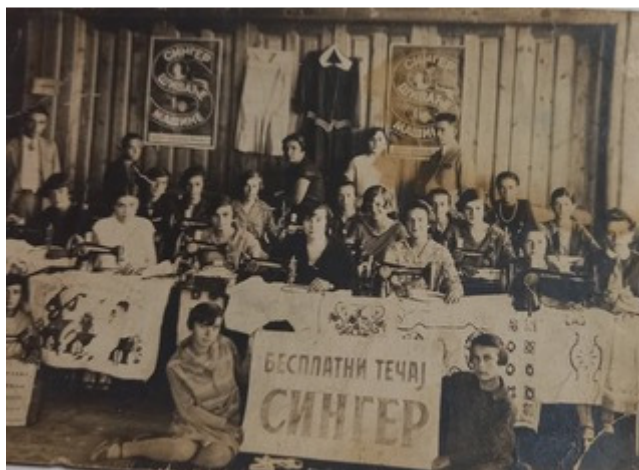
Figure 2. Course for adult girls, Kruševo, about 1930.