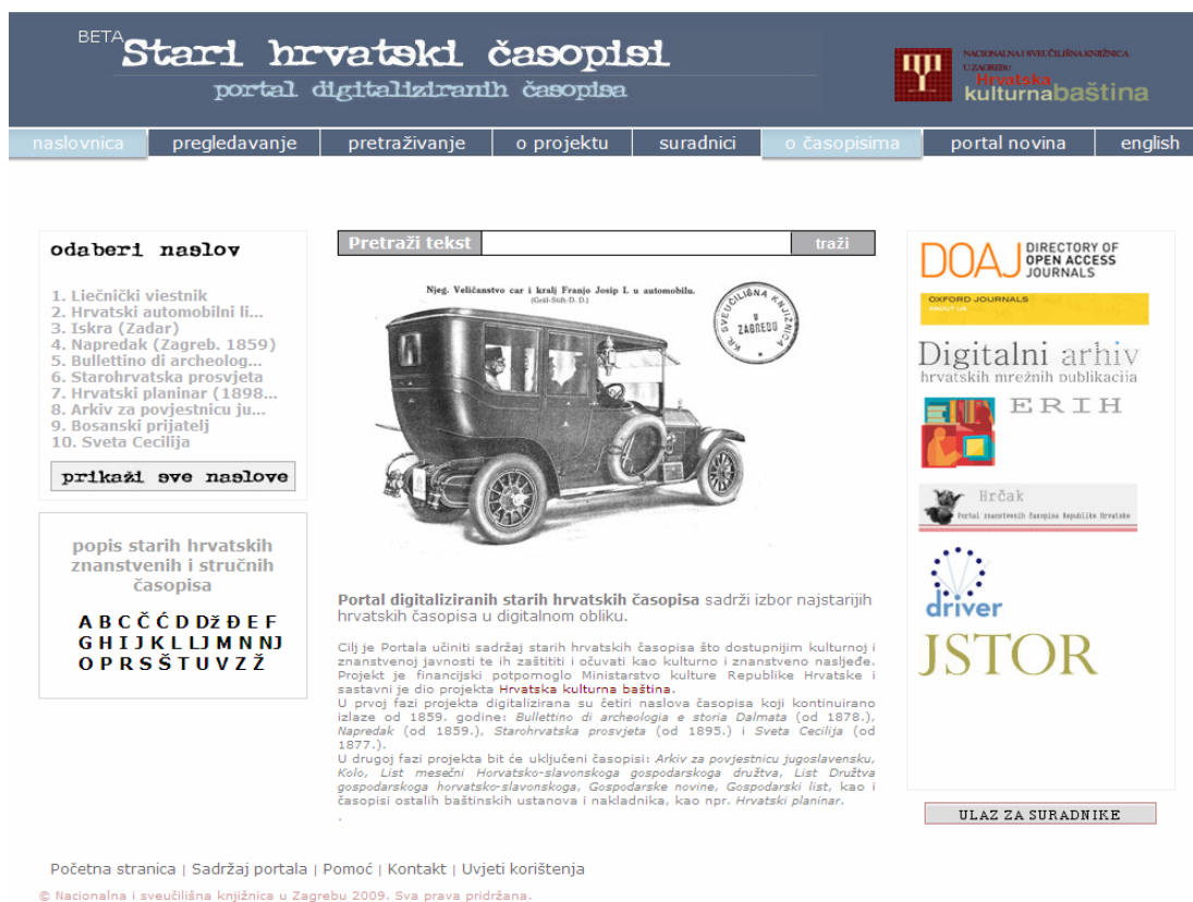
Fig. 3 Digitised journals – title page

Newspapers in Croatia date back to 1789, when the first Croatian newspaper Kroatischer Korrespondent was published, and journals to 1851 when the first Croatian learned journal Arkiv za povjestnicu jugoslavensku was published.