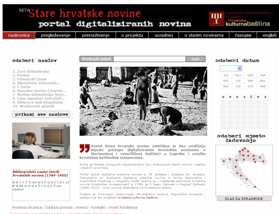
Fig. 2 Digitised newspapers – title page