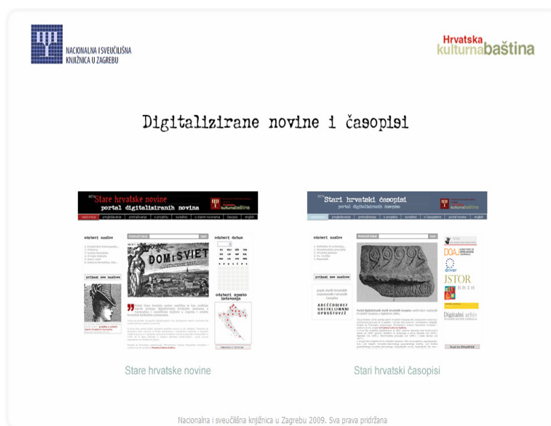
Fig. 1 Digitised Croatian Historic Newspapers and Journals

The portal was launched in 2010 when it was made available to the public on the web site of the National and University Library in Zagreb ( http://dnc.nsk.hr ).