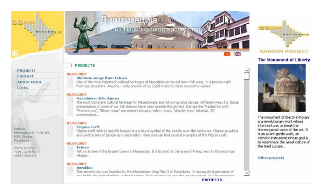
Fig. 1. CDNH Portal - list of projects

Most of the digitized material concerning the national and cultural heritage produced by CDNH and the students taking the Multimedia course is presented on the CDNH Portal (<a href="www.cdnh.edu.mk">www.cdnh.edu.mk</a>), shown on Fig.1. Therefore we could claim that the Portal of CDNH represents a collection of multimedia presentations of the Macedonian National Heritage. Many artefacts of the Macedonian cultural and national heritage, such as well known monuments, people and events, are presented in this Portal. The tradition, the customs, the music and the folk dances, the natural beauties of Macedonia, historically important people, sacred object and archaeological sites are digitized and available for exploration to the Macedonian and the foreign community.