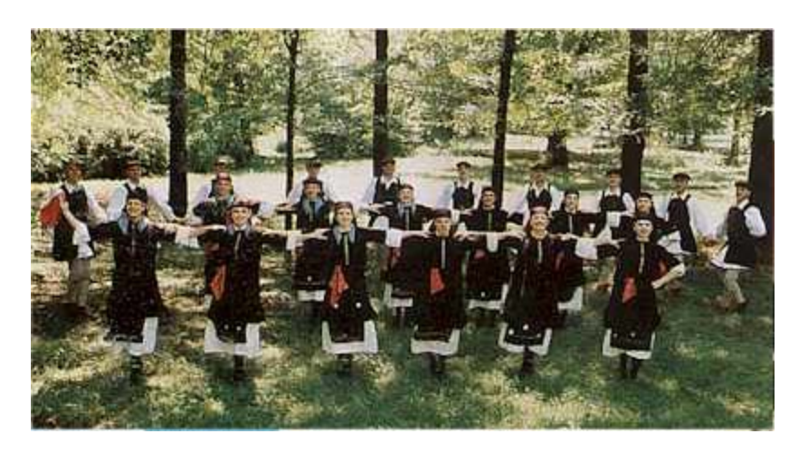
Fig. 4. Macedonian folk dance

The digitized materials included in the Portal of CDNH are incorporated in separate Projects based on principles of locality or homogeneousness. Any of the Projects could be accessed through the list of the Projects (Fig 1). The Portal of CDNH offers the additional functionality of searching for the digitized materials through categorized search. The categories offered on the Portal of CDNH are: Architecture, Archaeology, History, Multimedia, Ethnology, Culture, Geography, Religion, Literature and Museums.