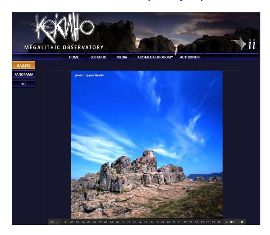
Fig. 2. Gallery of the one of the oldest megalithic observatories in the World - Kokino