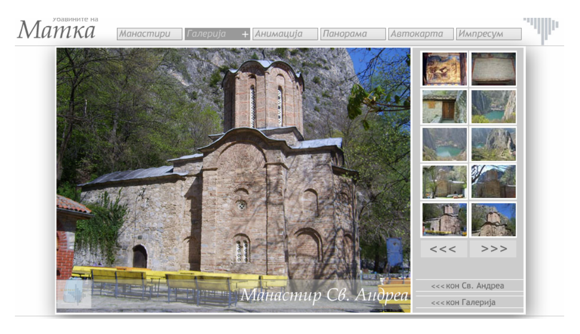
Fig. 5. Gallery of the monastery St. Andrea in the area of Matka Lake

A significant number of the contemporary IT techniques, that are state of the art in the presentation of the national heritage in the world today, are included in the portal of CDNH. Many of the Projects in the CDNH portal integrate galleries, video presentations, 3D models, animations and panoramas (Fig 4 and Fig.5).