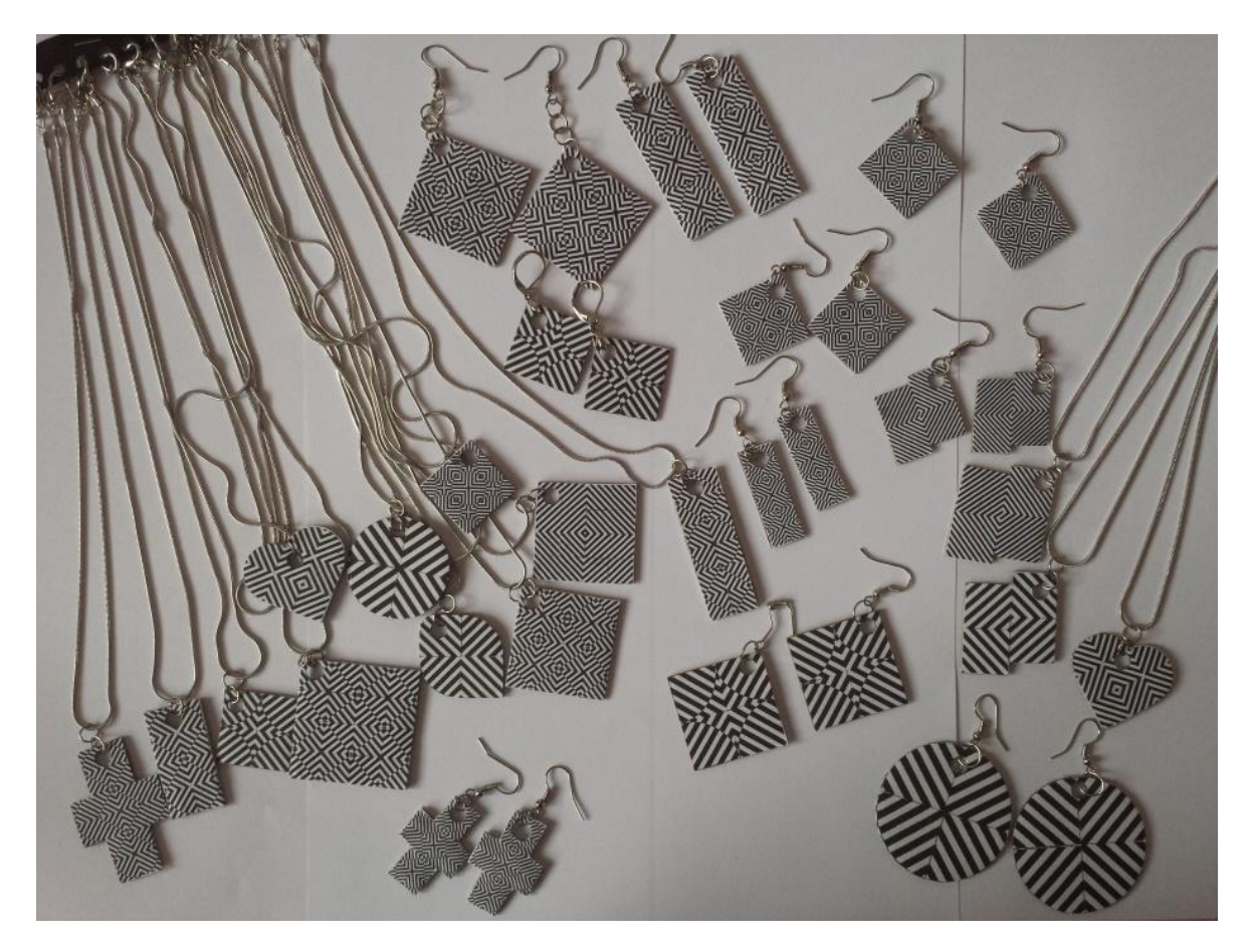
Figure 3: Jewellery inspired by optical ornaments

The pride of all my work with optical ornaments is the jewelry collection inspired by the beauty of optical ornaments. Jewelry like this is always popular, everywhere and with everybody, irrespective of what the fashion sets at that moment. It cleanses our minds from every environmental impact. When it comes to my students, they take great pride on the fact that their ornaments, besides my own, can be seen on these pieces of jewelry.